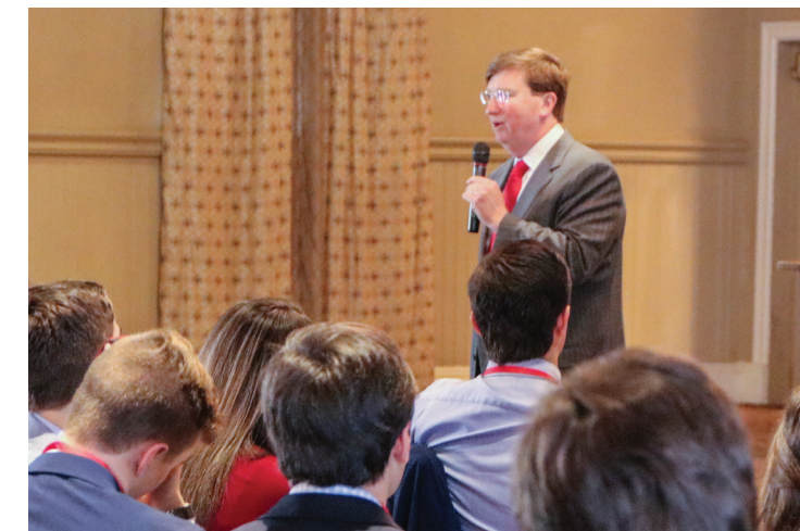
Gov. Tate Reeves spoke to the students at the Old Capitol Inn.