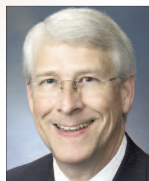
ROGER WICKER United States Senator