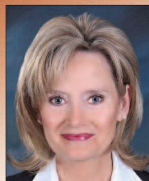
CINDY HYDE-SMITH United States Senator