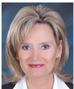
CINDY HYDE-SMITH United States Senator