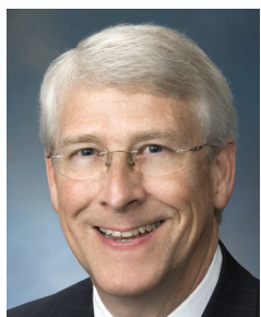
ROGER WICKER United States Senator