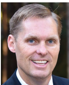
MICHAEL GUEST Third District