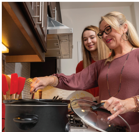
Use smaller kitchen appliances, like slow cookers, toaster ovens and convection ovens when possible. These smaller appliances use less energy than a full-size oven.

Help large appliances work less. There are small ways you can help your larger kitchen appliances run more efficiently. For example, keep range-top burners clean from spills and fallen foods so they'll reflect heat better. When it's time to put leftovers in the refrigerator, make sure the food is covered and allow it to cool down first. That way, the fridge doesn't have to work harder to cool warm food.