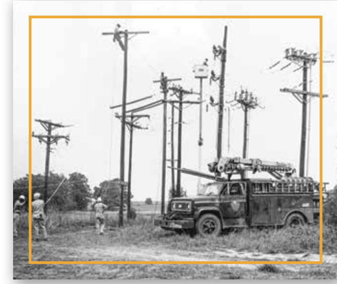
Central Electric crews working in the Sandhill community in 1978.

We care about our communities — because we live there too.