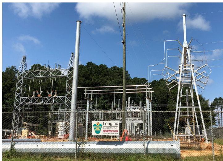
This substation will serve members in northern Neshoba County.

All these improvements will increase the reliability and service quality to the members they serve.