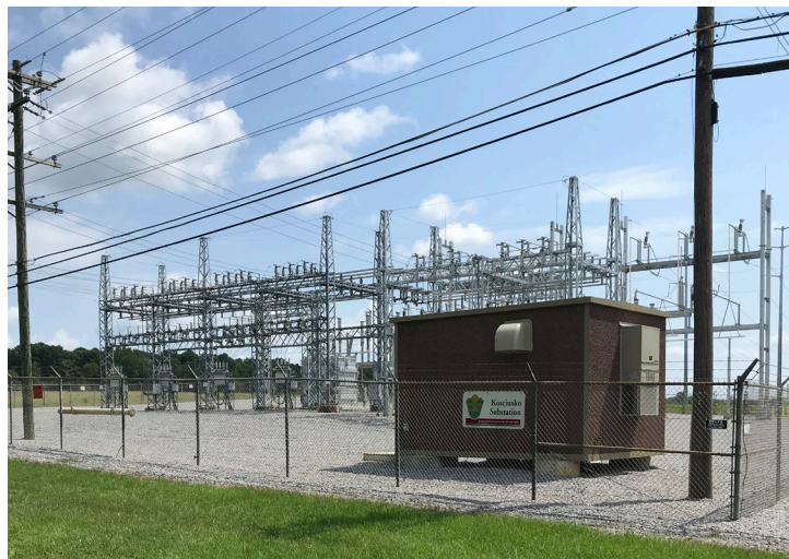
Kosciusko Substation serves members in Attala County.

These new 161/25 kV substations have the capacity to serve many years of residential, commercial, and industrial growth.